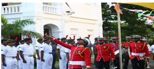
73 rd Independence Day (15-08-2019)