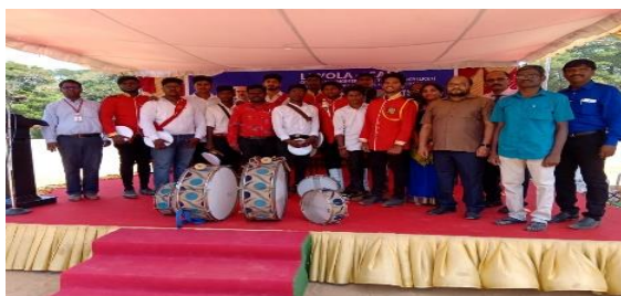
10 th Annual Sports Day of LICET (22-02-2020)