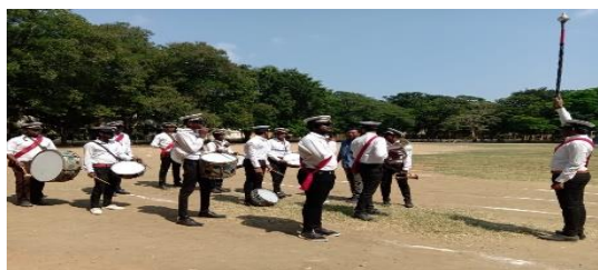
13 th Sports Day of Loyola B.Ed. College (01-02-2020)