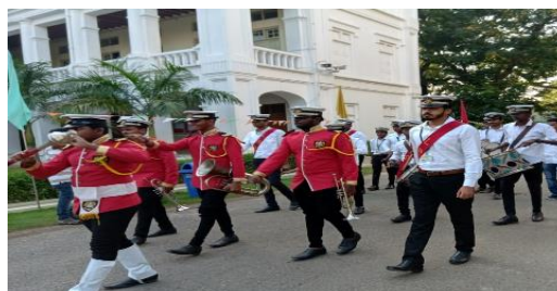
92 nd Graduation Day of Loyola College (22-02-2020)