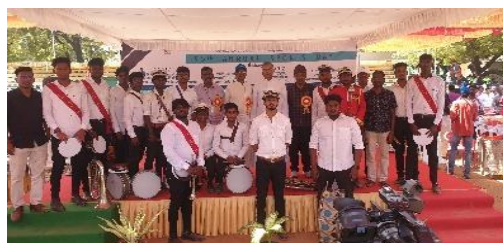
75 th Loyola Annual Sports Day (08-02-2020)