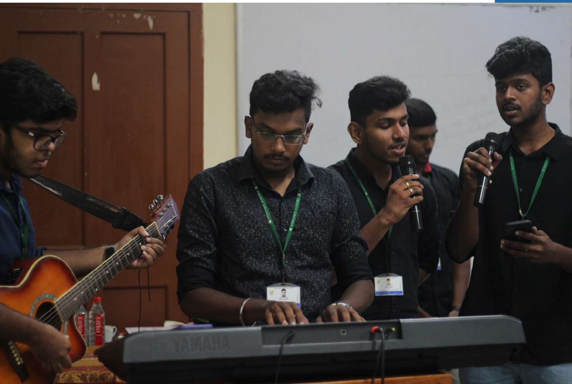
Prayer Song by Department Choir