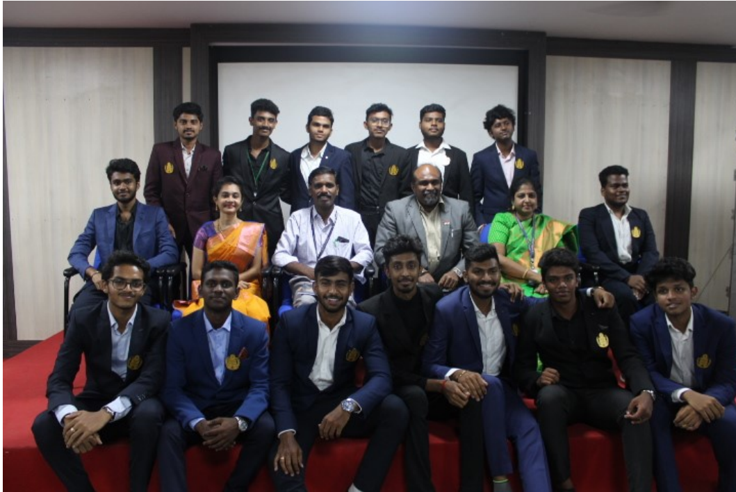
LOYOLA COMMERCE FORUM OFFICE BEARERS (2022-2023).