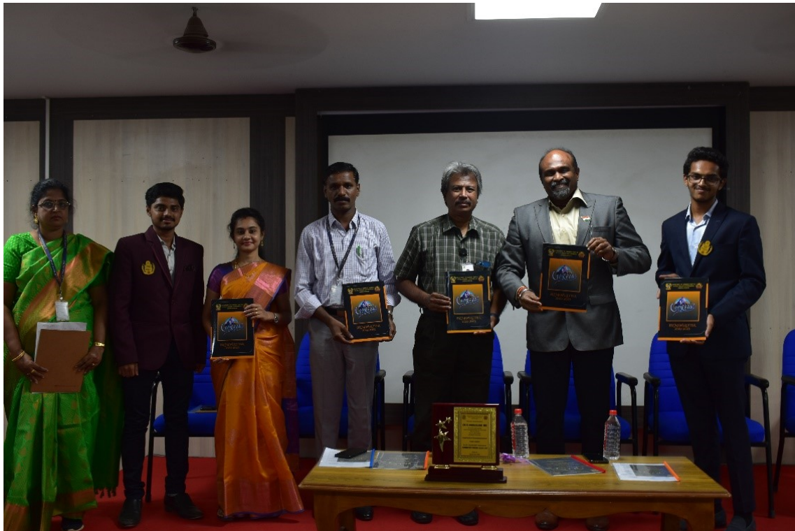
NEWSLETTER CRESCENDO LAUNCHED DURING THE CEREMONY