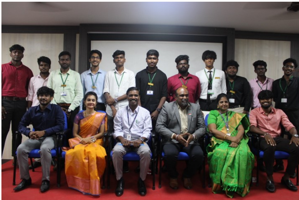
CLASS REPRESENTATIVES FOR THIS ACADEMIC YEAR (2022-2023)