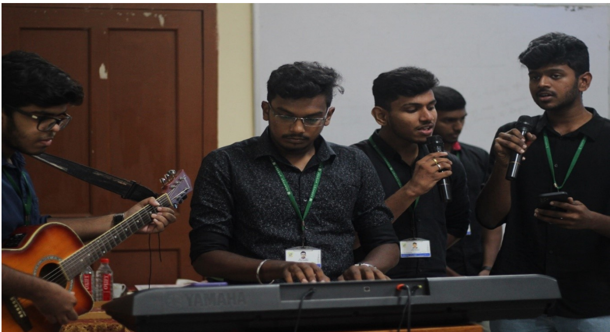
Invocation Song by Department Choir