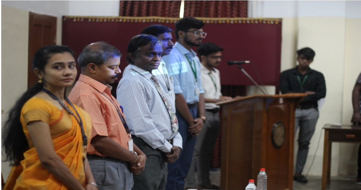
Chief Guest & Dignitaries alight for Prayer