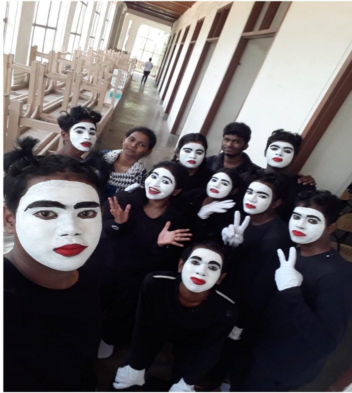
Our mime team