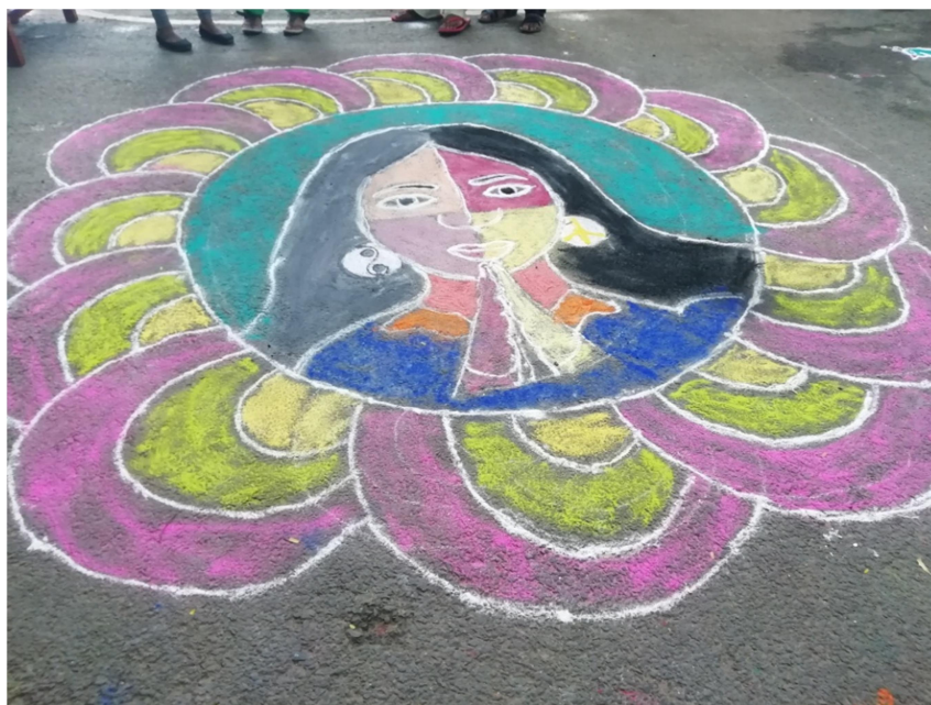
Rangoli drawn by the students of the Department of English

The inter departmental cultural extravaganza of Loyola college: Ovations 2019 began on September 5. The off stage events rangoli and face painting marked the beginning of the competitions. The theme of ovations for this year was "Solidarity of Euphony - Harmony among the society". The students of the department of English gave their best this time by participating for almost all events. Their hard work and dedication proved that participation is better than winning on one hand while on the other hand, they established how true effort can yield fruitful results by winning in 2 offstage events namely potpourri and street theatre. While a three member team secured second prize in potpourri, for the second consecutive year the department won third prize in street theatre. Ovations 2k19 was not just an exposure to culturals, it was a wonderful experience for many students. First year PG students and second year UG students displayed greater interest and better participation among all other classes. Hence ovations 2k19 was the joint effort of the entire department which came to an end on September 21st.