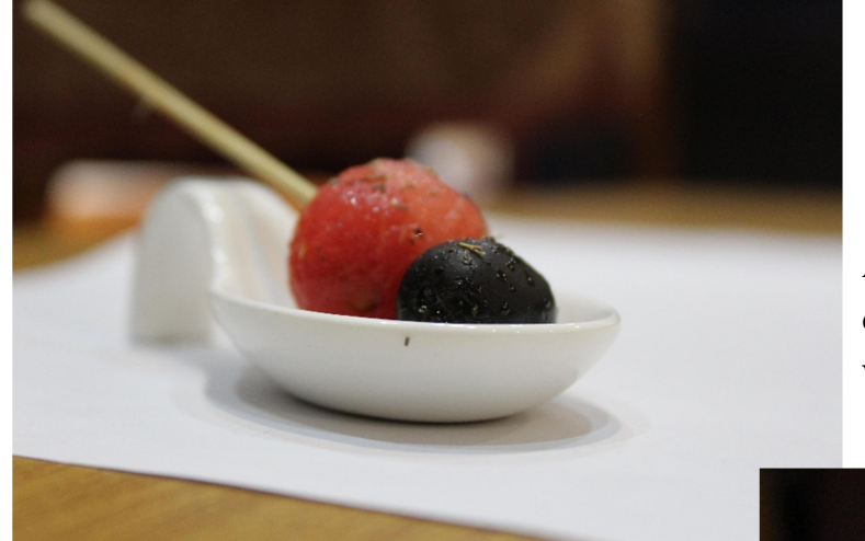
Amuse bouche – À hors d'oeuvre made with marinated watermelon and olives.