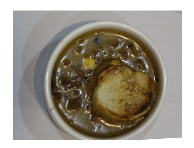
Starter – Sautéed Camembert with a slice of baguette