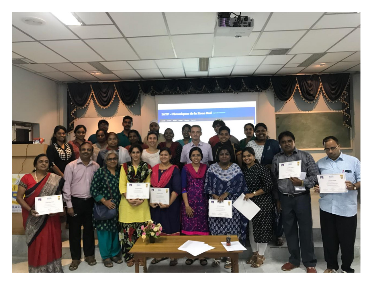
The French teachers who attended the regional workshop