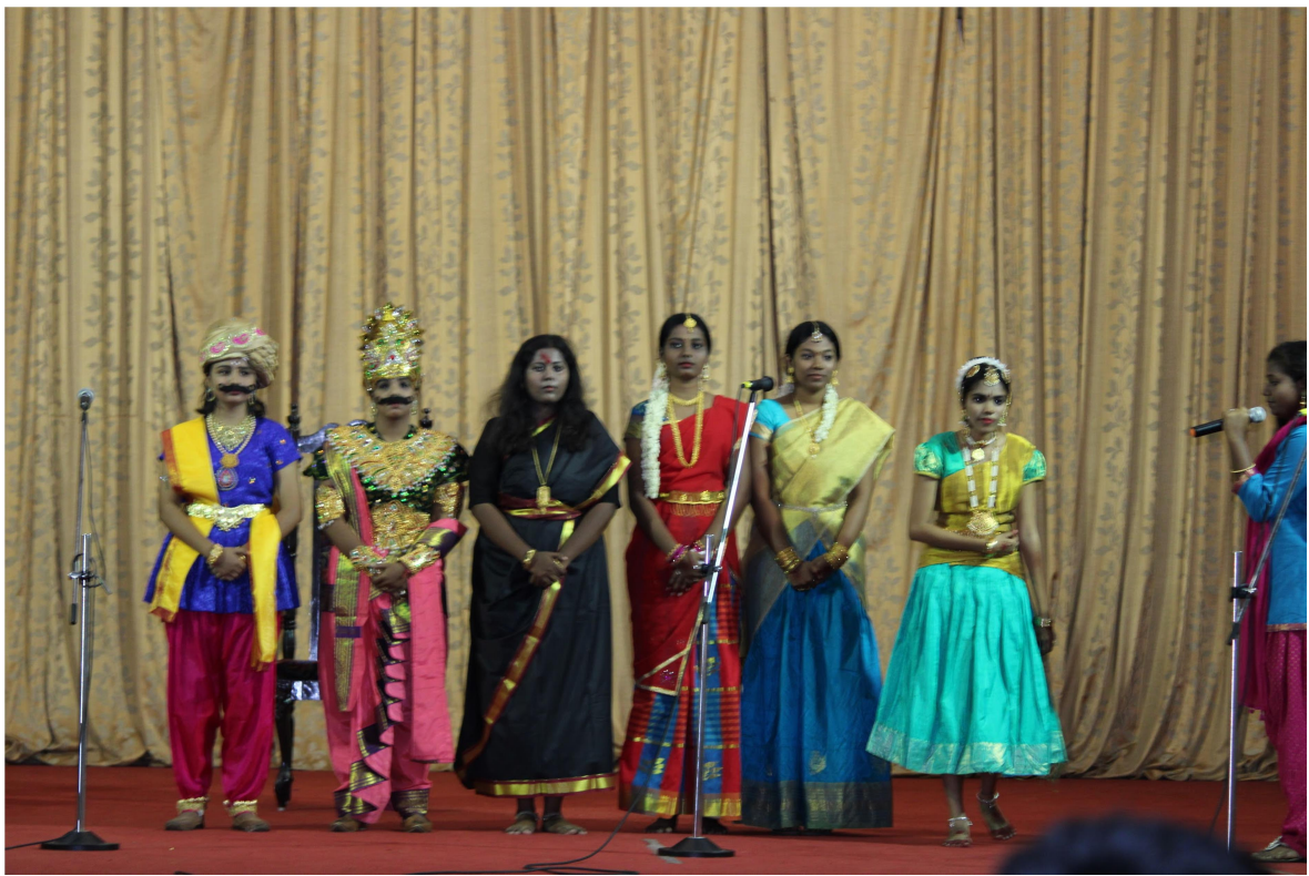
Kannagi demande Justice, a play in French translated and played by the B.A.French students