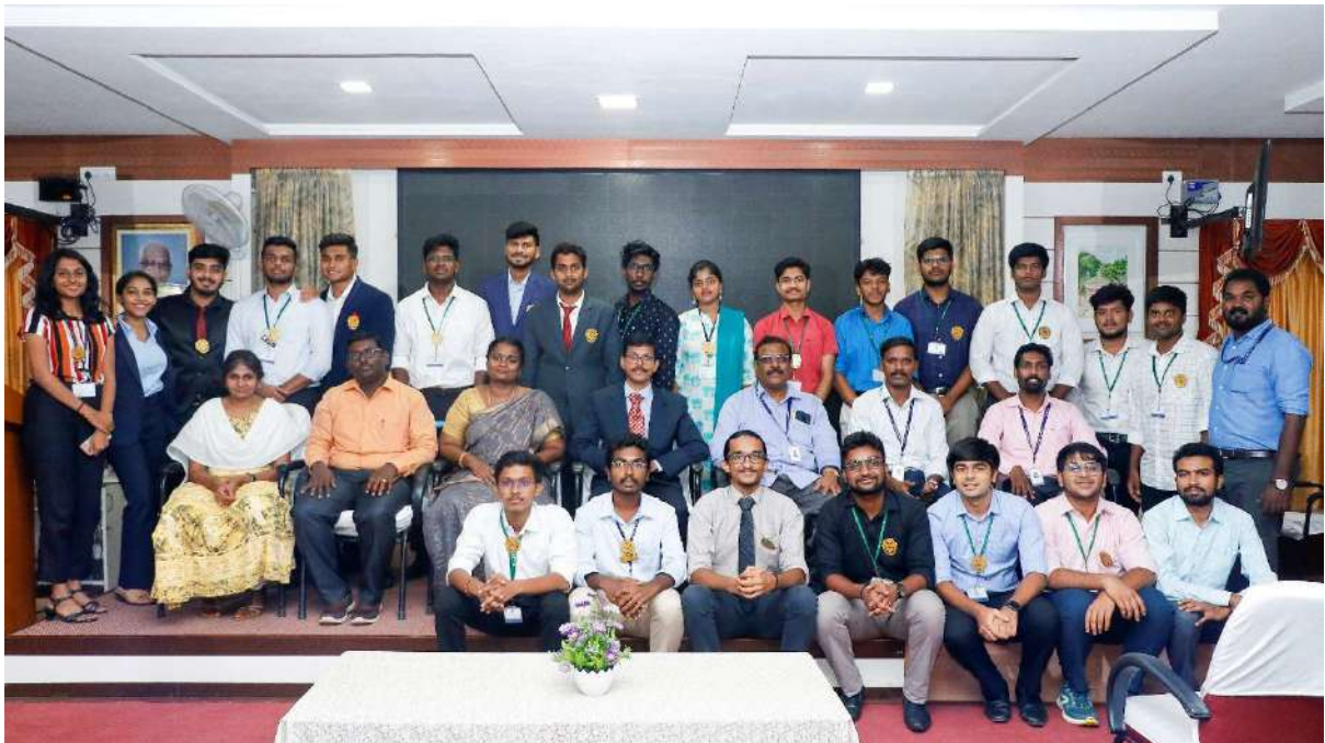
Organising Team of the State Level Technical Workshop on IPR