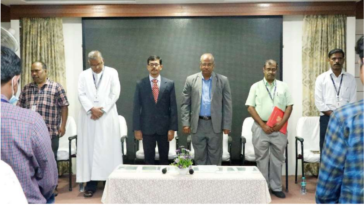
Invocation (Prayer Song & Thamizh Thaa Vaazhthu)