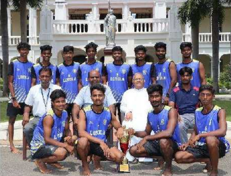
Loyola College, Chennai beat Avichi College 14-11 in the finals of the 89th year of Bertram Memorial Kho Kho tournament held at Loyola College in Chennai. Final Placings : 1. Loyola College, Chennai, 2. Avichi College of Arts & Science, Chennai, 3.Velkalar Inst. of Arts & Science, Erode, 4. Guru Namak College, Chennai