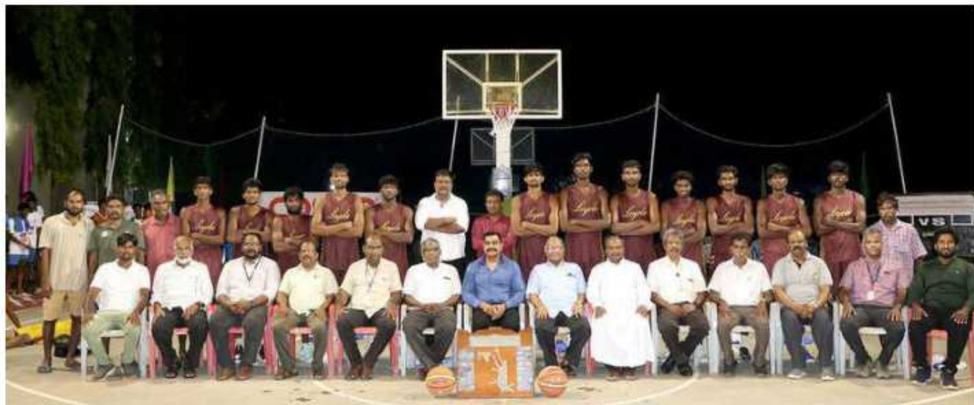
Shining bright: Loyola Whites pipped MCC in an exciting final.