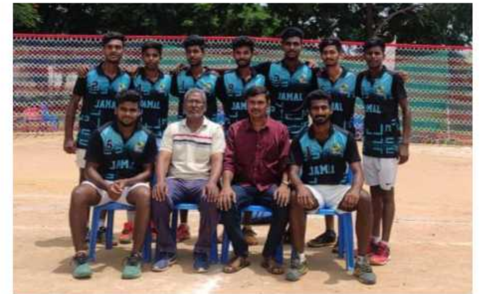
Triumphant: Jamal Mohamed College won the ball badminton title in the Bertram tournament.