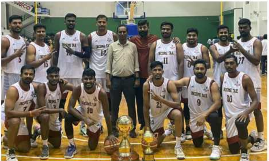
It's IT: Income Tax (Chennai) defeated Indian Army (New Delhi) 75-71 to win the PSG Trophy basketball in Coimbatore recently.