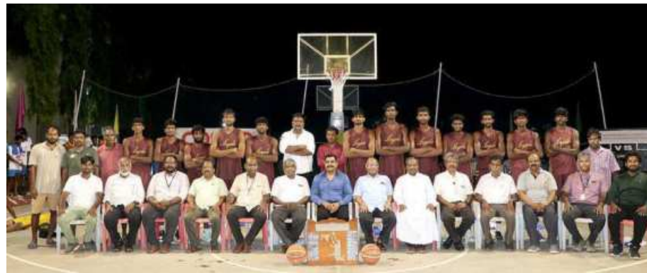
Shining bright: Loyola Whites pipped MCC in an exciting final.