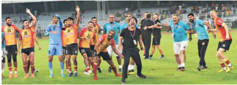
Ecstatic! East Bengal players celebrate their come-from-behind win.