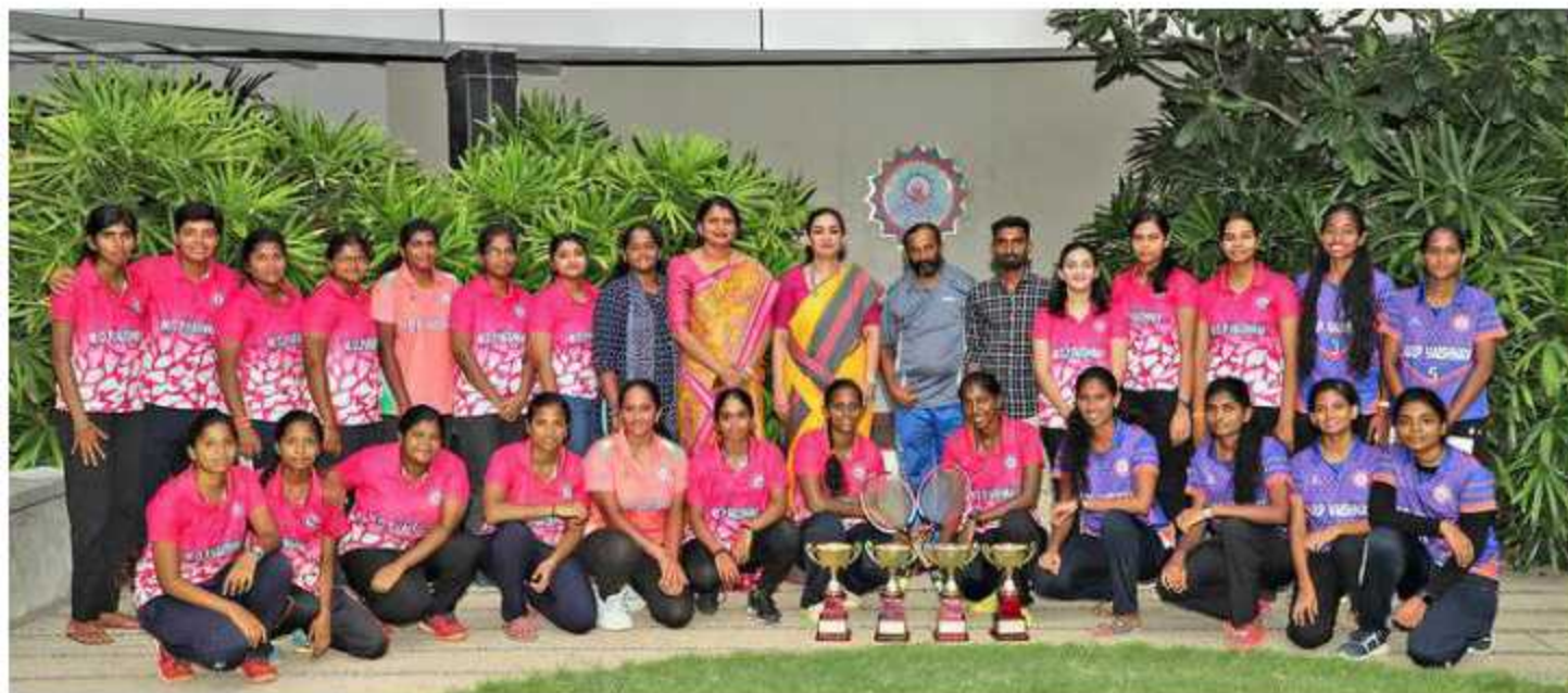
On a high: M.O.P. Vaishnav team members who bagged the tennis, chess, ball badminton, and volleyball titles at the WCC Trophy tournament 2023.