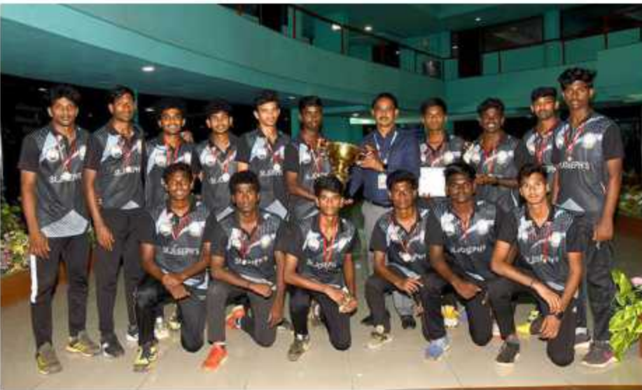
Topping the charts: St. Joseph's CoE, winner of the Thiru Karumuttu Thiagarajan Chettiar memorial State-level hockey.

Loyola Whites hoopsters reign Loyola Whites clinched