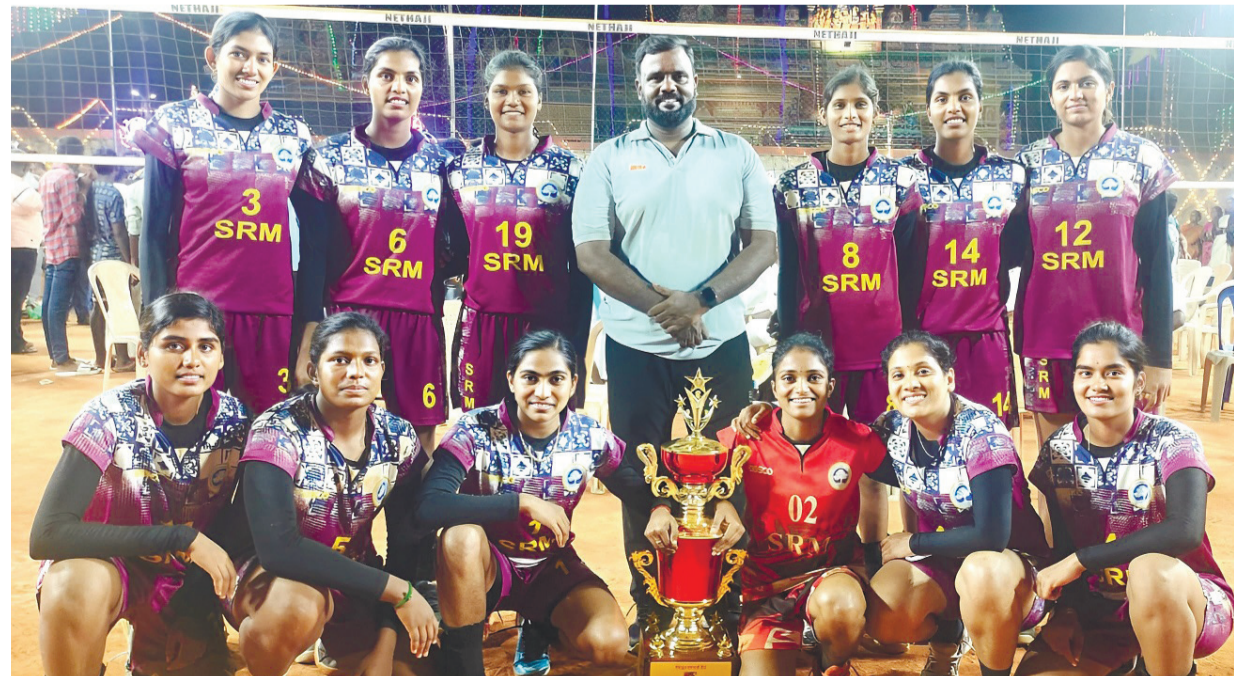
SRM IST Volleyball (W) team beat PKR in the finals 25-14, 25-15 and won the Gold Medal at the State Level Invitational Volleyball Tournament held at Nethaji Subhash Chandra Bose Volleyball Club, Villupuram.