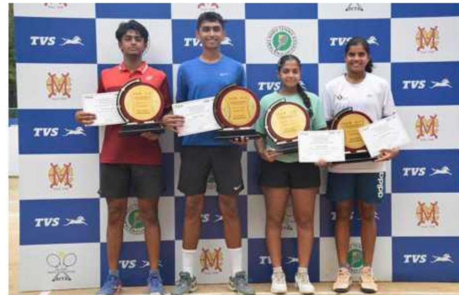
On top: The winners in the boys' and girls' categories of the TVS MCC tennis tournament.