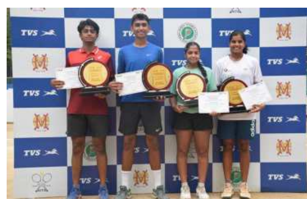
On top: The winners in the boys' and girls' categories of the TVS MCC tennis tournament.

Jamal Mohamed College, Tiruchi, defeated Loyola Whites 35-37, 35-27, 35-33 in the final of the 89th Rev. Fr. Bertram Memorial ball badminton tournament, organised by Loyola College, on Friday.