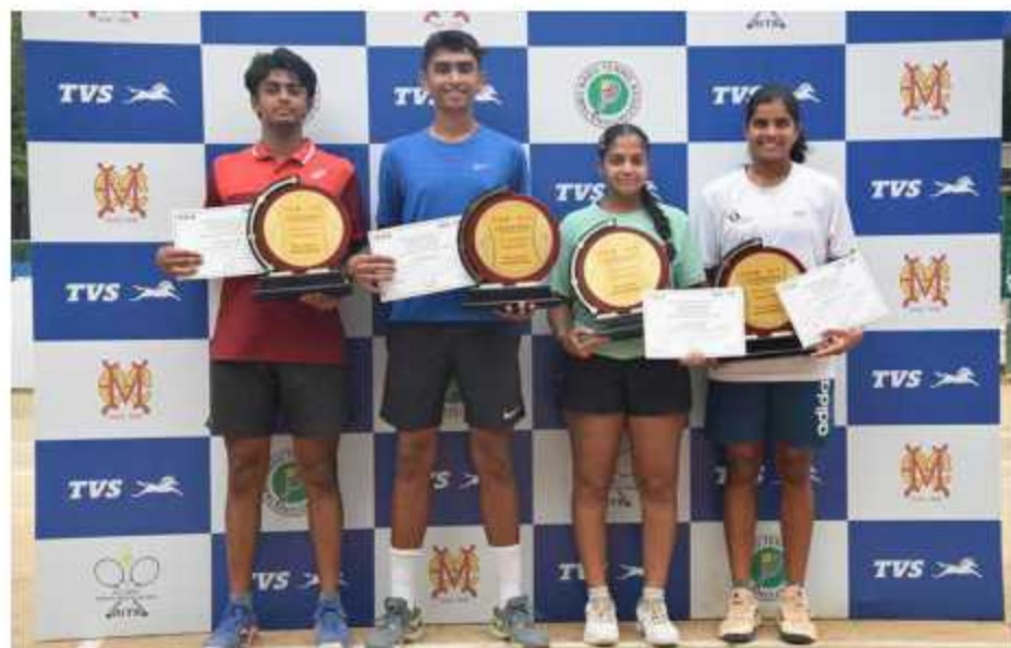
On top: The winners in the boys' and girls' categories of the TVS MCC tennis tournament.

Jamal Mohamed College, Tiruchi, defeated Loyola Whites 35-37, 35-27, 35-33 in the final of the 89th Rev. Fr. Bertram Memorial ball badminton tournament, organised by Loyola College, on Friday.