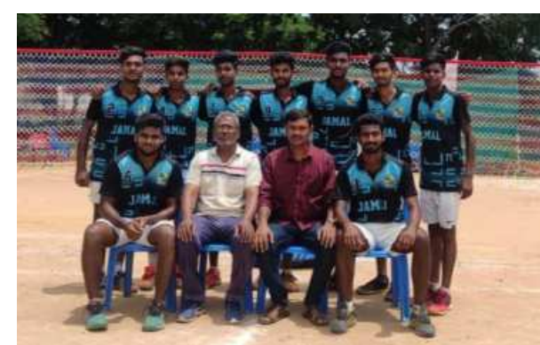
Triumphant: Jamal Mohamed College won the ball badminton title in the Bertram tournament.