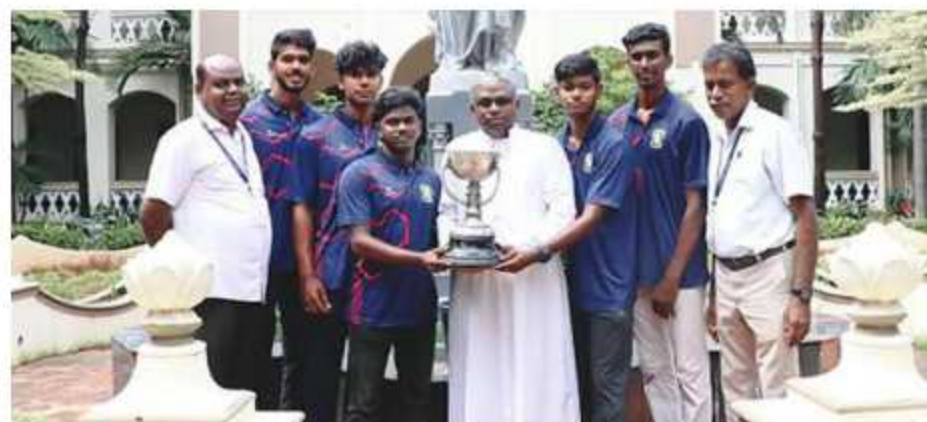
Champs: The Loyola team that won the Erskine Cup for tennis.

Tamil Nadu drew with Jharkhand as play was washed out on the fourth day of the warm-up match in the Jharkhand (u-23)