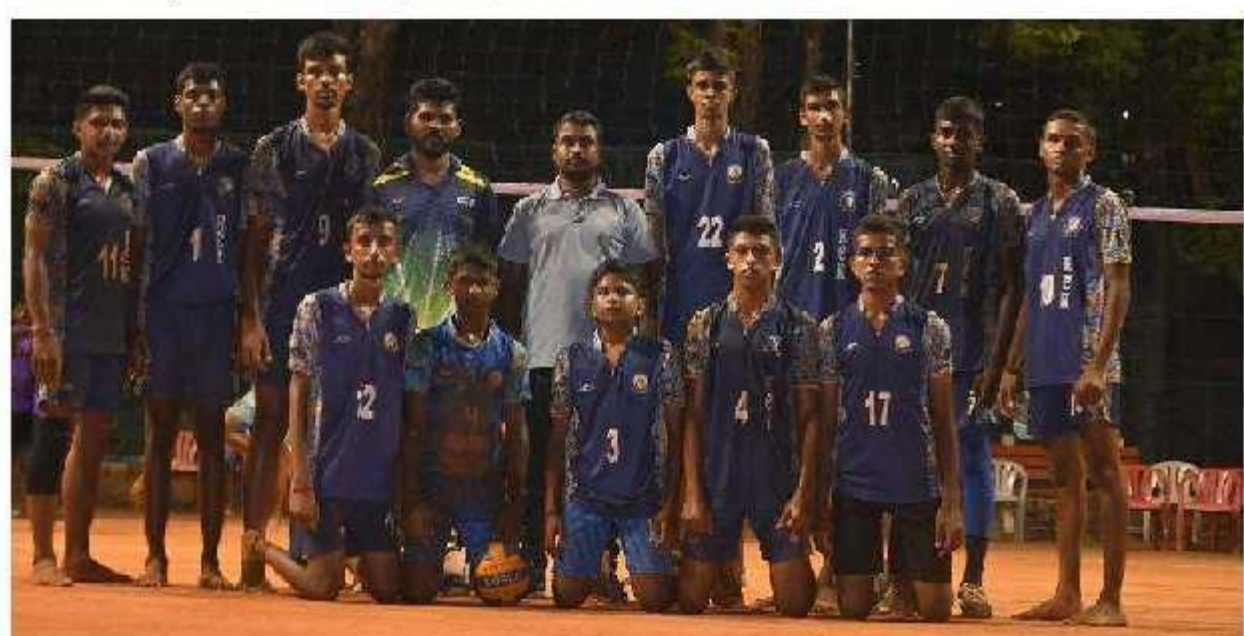
Aggarwal Matric. Hr. Sec. School, Colmbatore won the Volleyball title in the 89th Bertram memorial tournament for School category organized by Loyola College. In the final league they defeated St. Berles Anglo Indian School, Santhome.