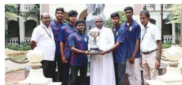
Champs: The Loyola team that won the Erskine Cup for tennis.

Tamil Nadu drew with Jharkhand as play was washed out on the fourth day of the warm-up match in the Jharkhand (u-23)