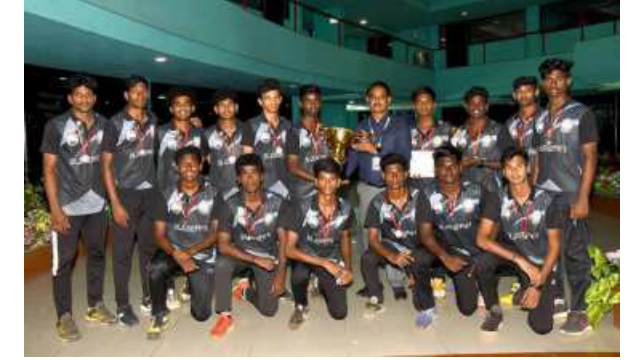
Topping the charts: St. Joseph's CoE, winner of the Thiru Karumuttu Thiagarajan Chettiar memorial State-level hockey.

Loyola Whites hoopsters reign Loyola Whites clinched