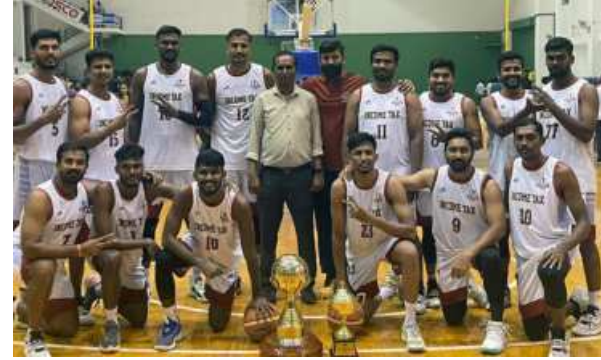
It's IT: Income Tax (Chennai) defeated Indian Army (New Delhi) 75-71 to win the PSG Trophy basketball in Coimbatore recently.