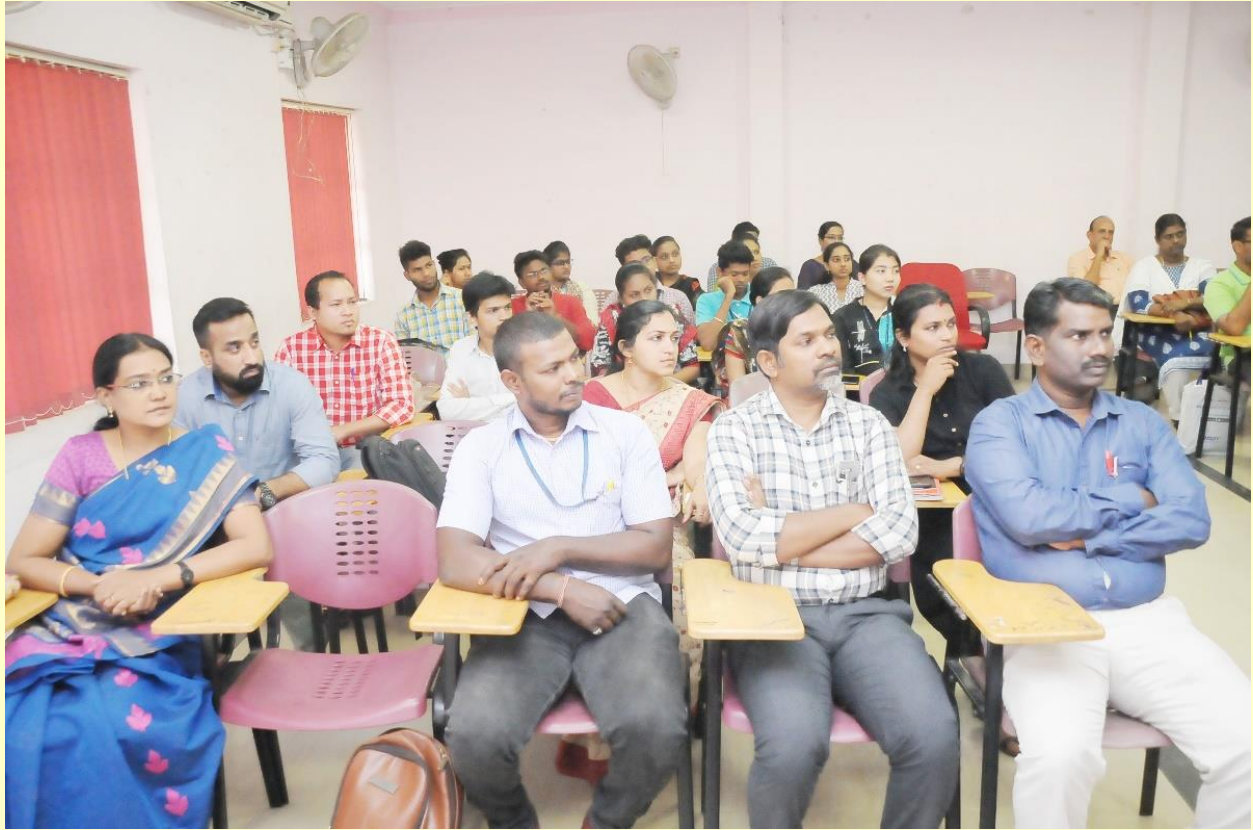
Section of the audience