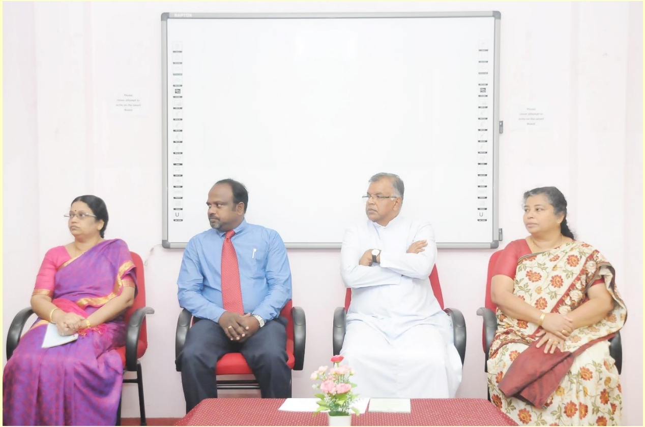
Chief Guest and Organizing team