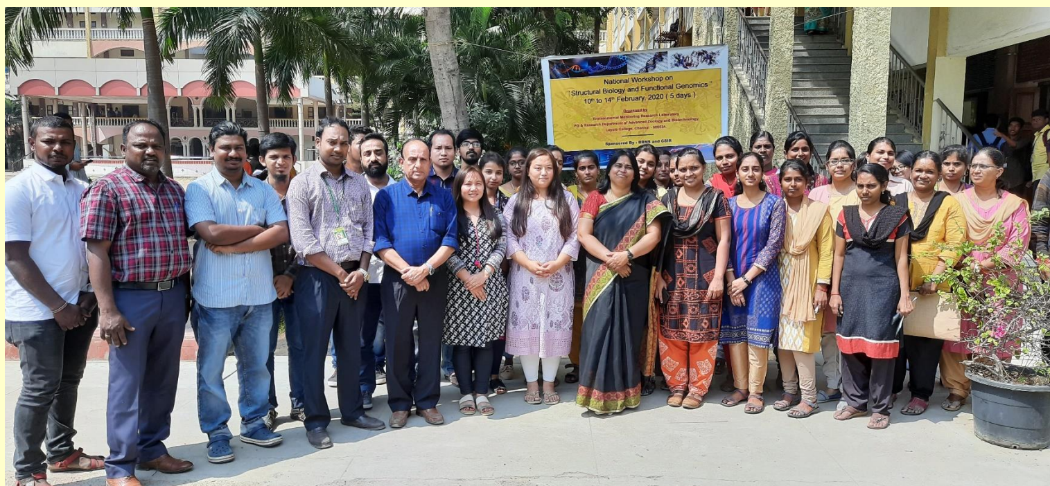
Section of the participants