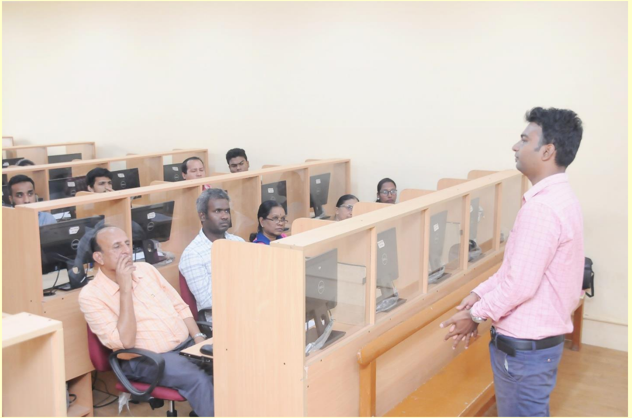
Technical session in progress