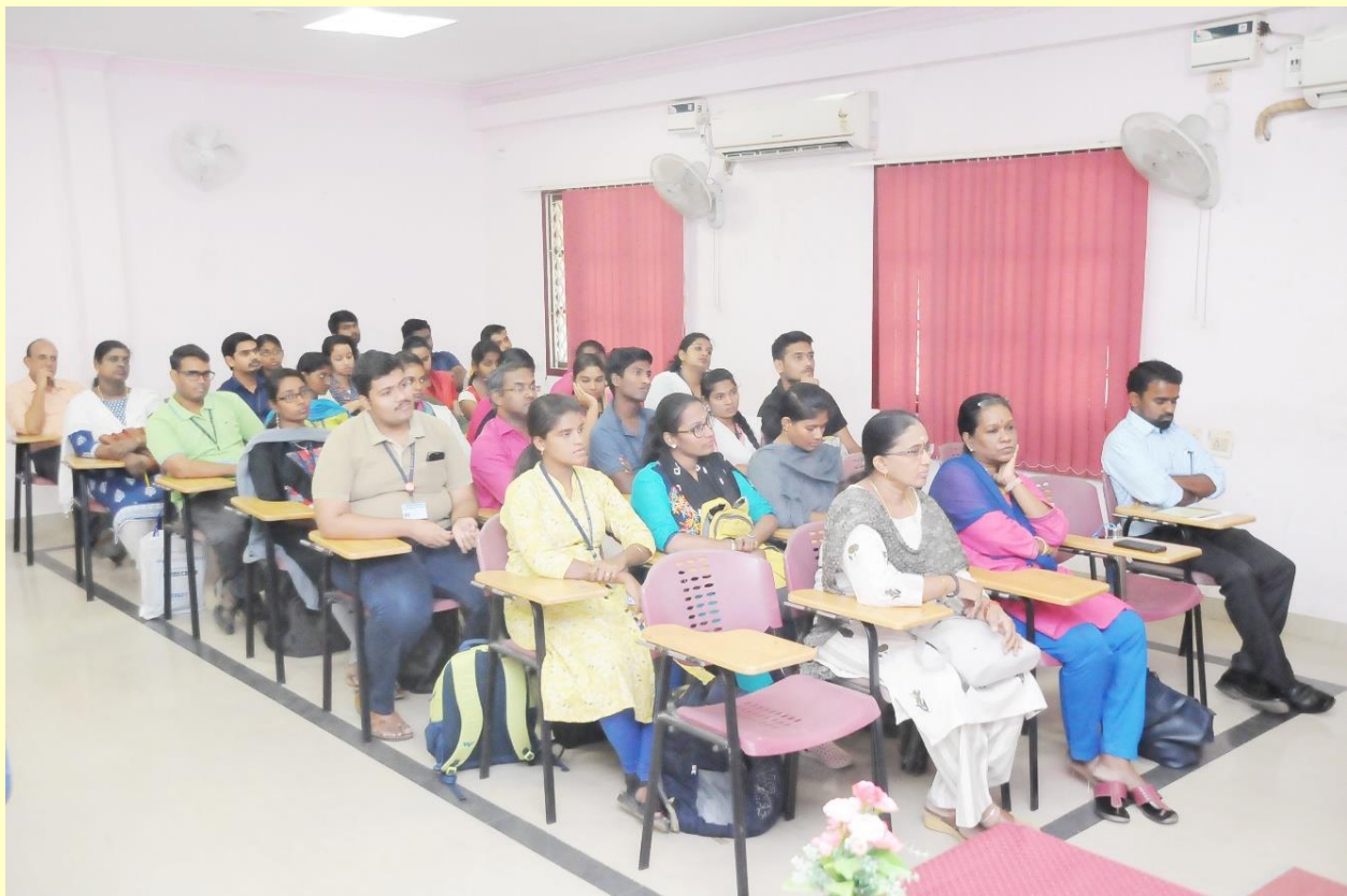
Section of the audience