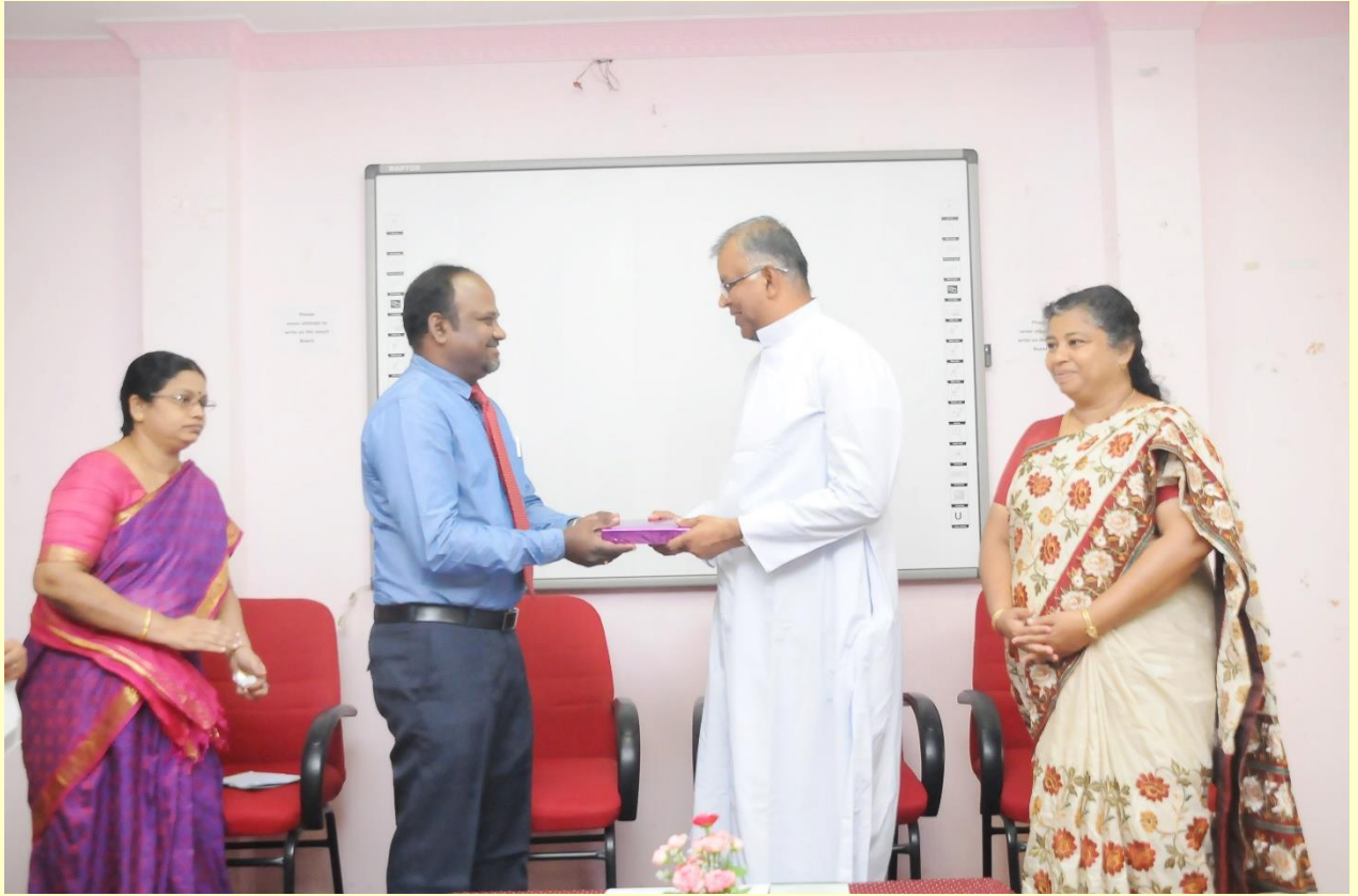
Souvenir to the Chief Guest