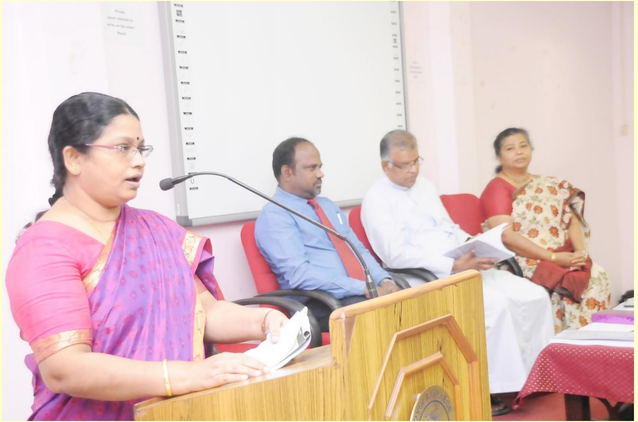
Vote of thanks by Organizing Secretary