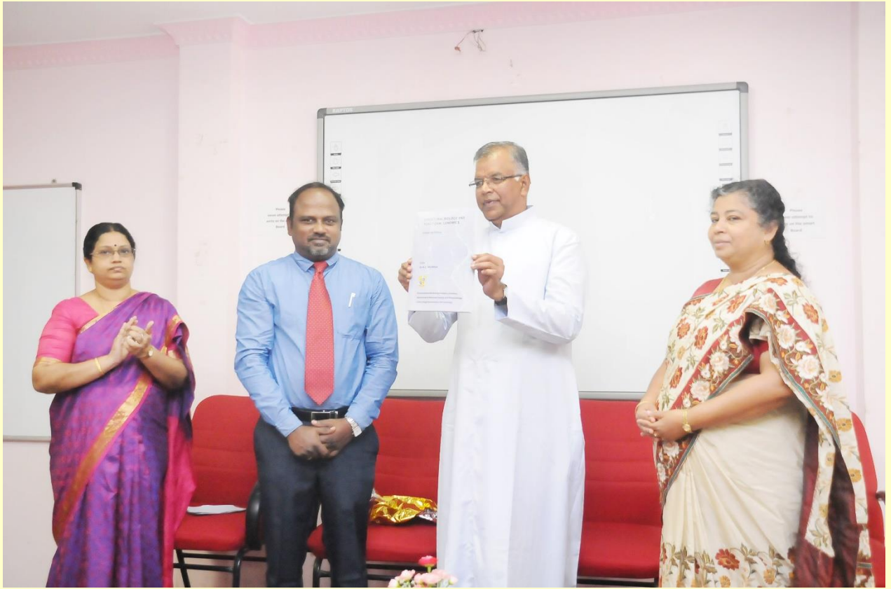
Release of the Training Manual