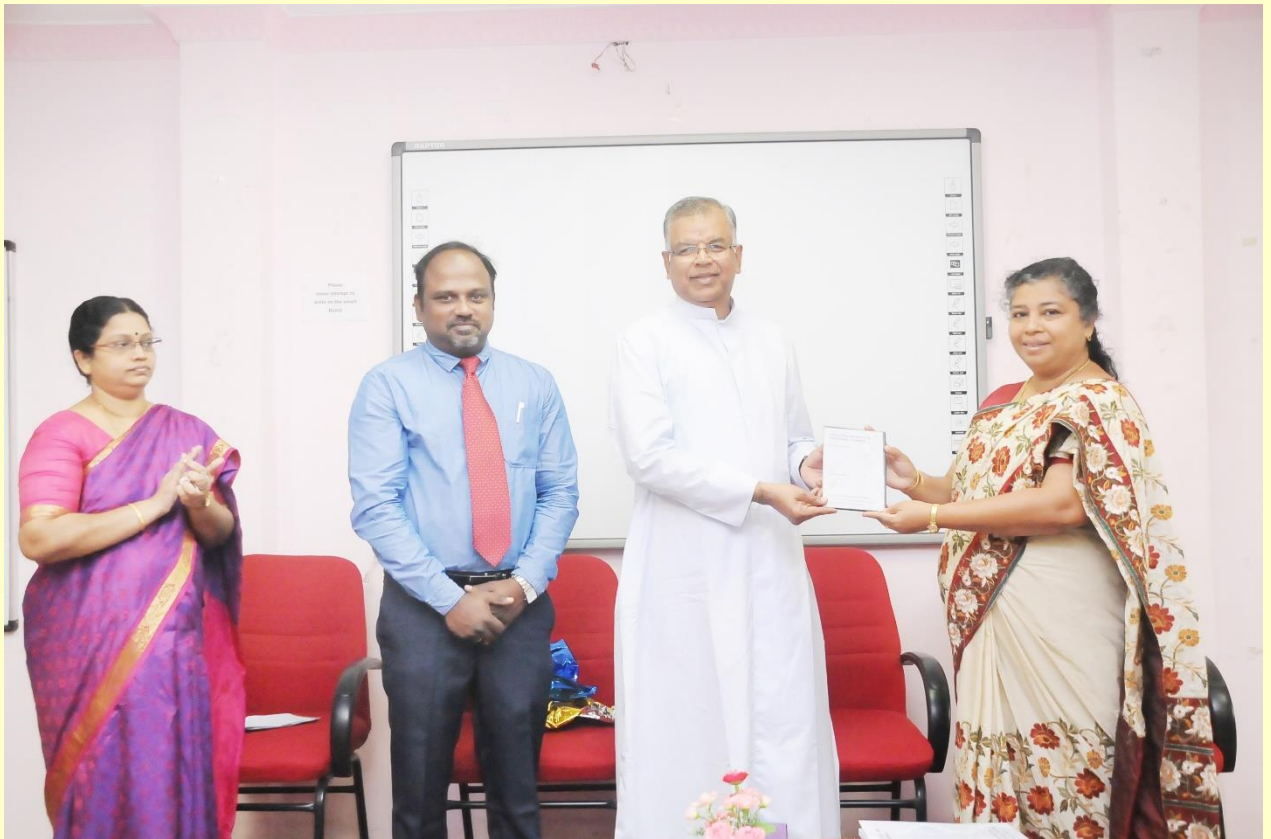
Release of CD