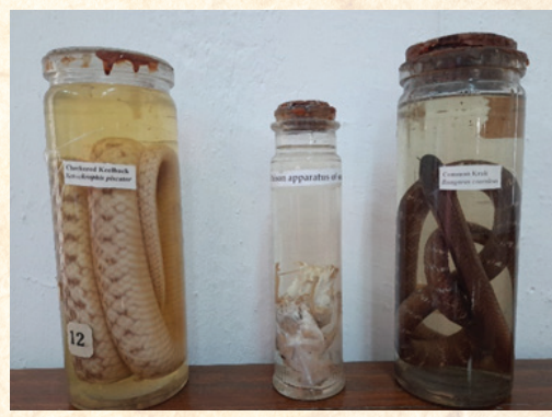
Poison Apparatus of Cobra