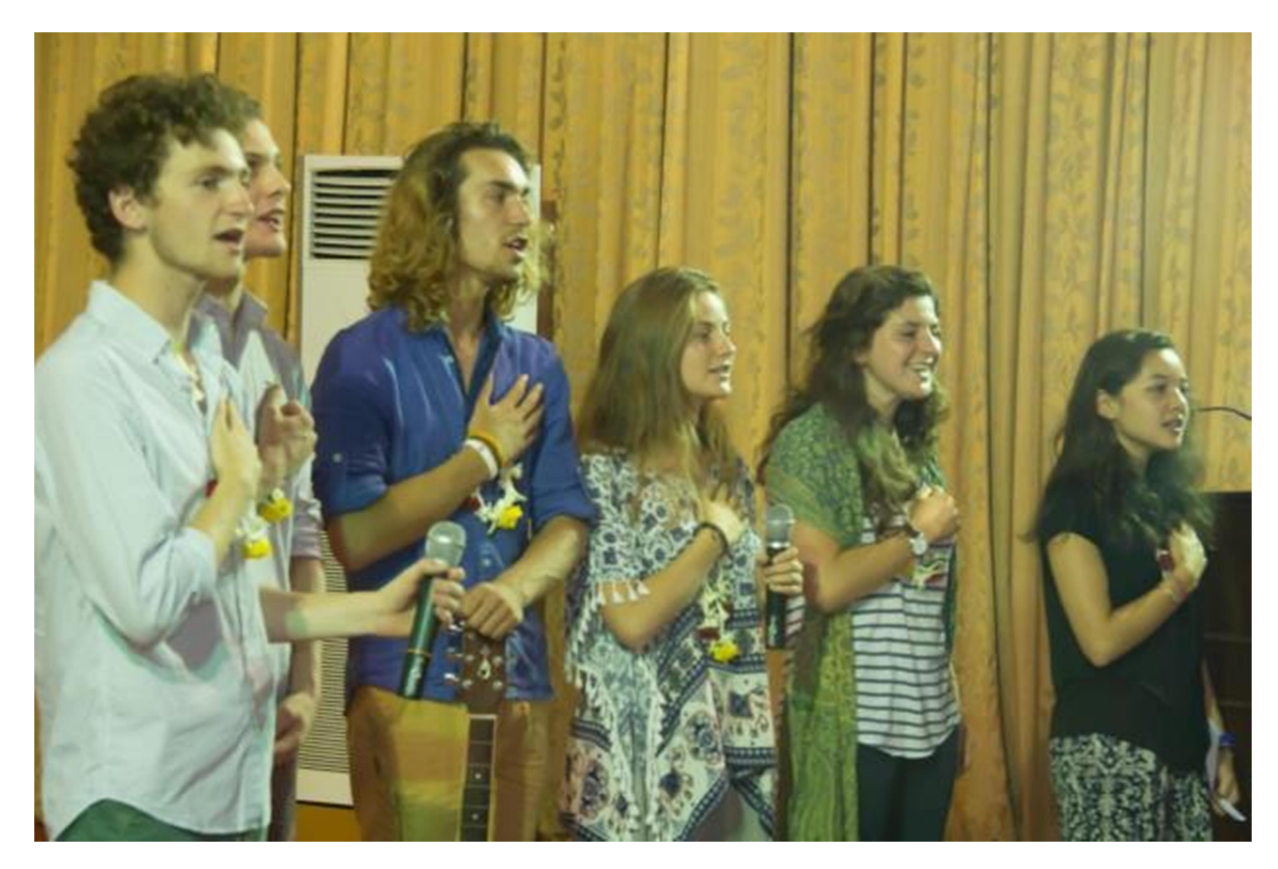
French students singing their national anthem during the Bastille Day celebrations

In the Ovations 2016, the B.A. French students participated and won several prizes like skit, Western Music, face painting and ship wreck. They won prizes in Shakespeare's play.