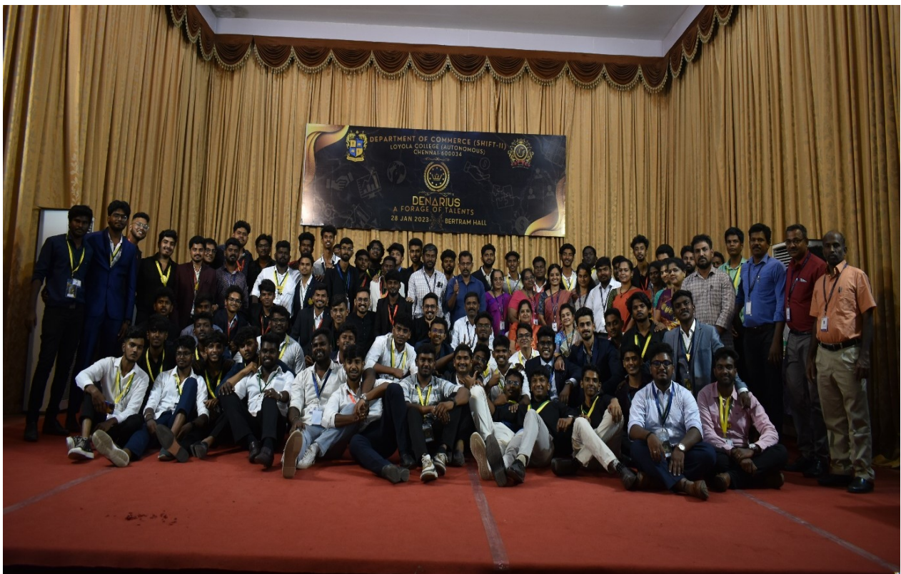
Faculty members, Professors, Forum members, Event heads, Volunteers.