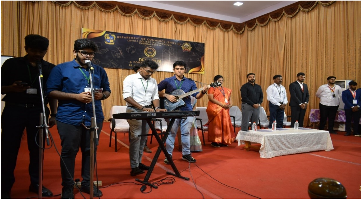
PRAYER BY DEPARTMENT CHOIR