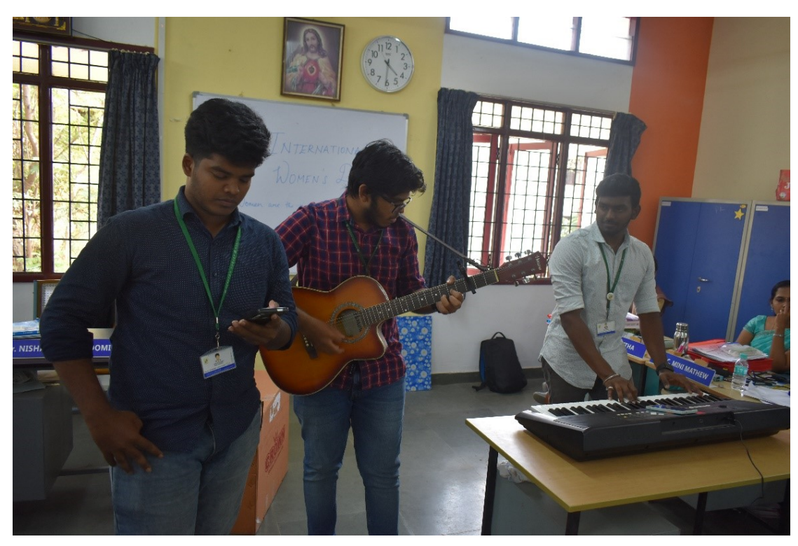
"AANANDHA YAAZHAI", A special melody by the choir in honour of Women's Day. WOMEN'S DAY ADDRESS BY STUDENTS