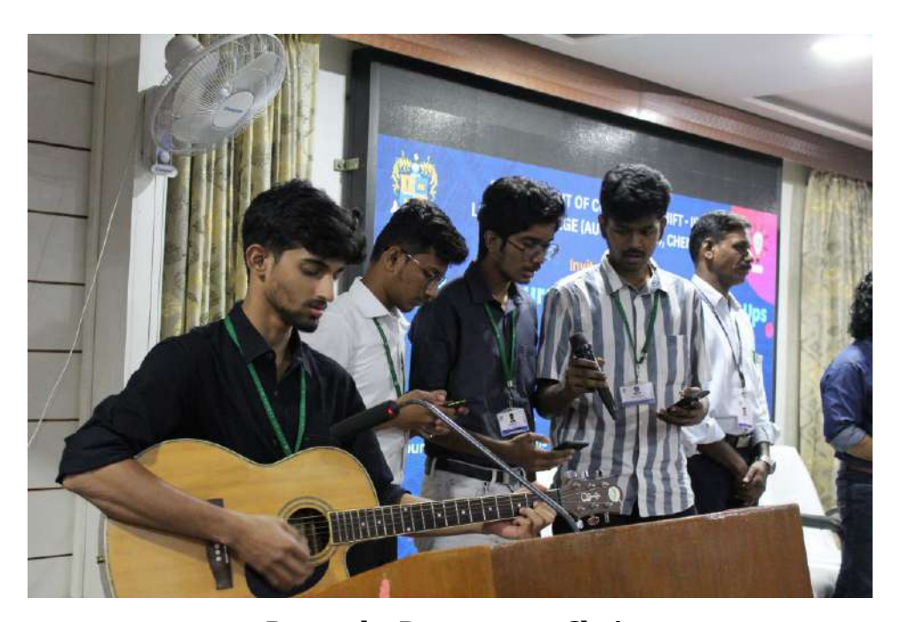
Prayer by Department Choir