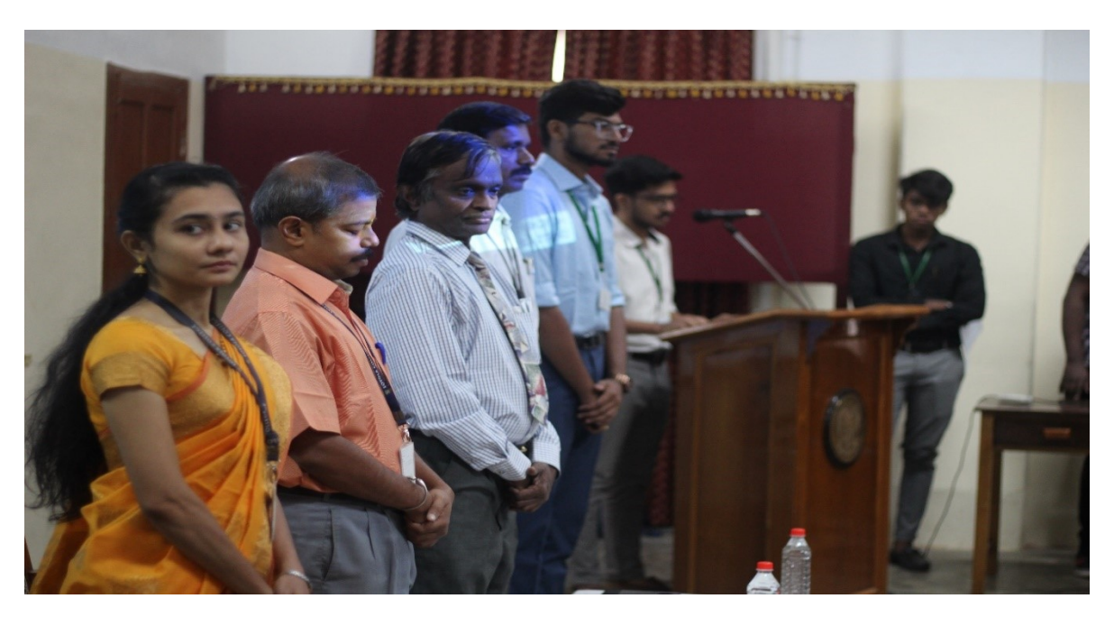
Chief Guest & Dignitaries alight for Prayer