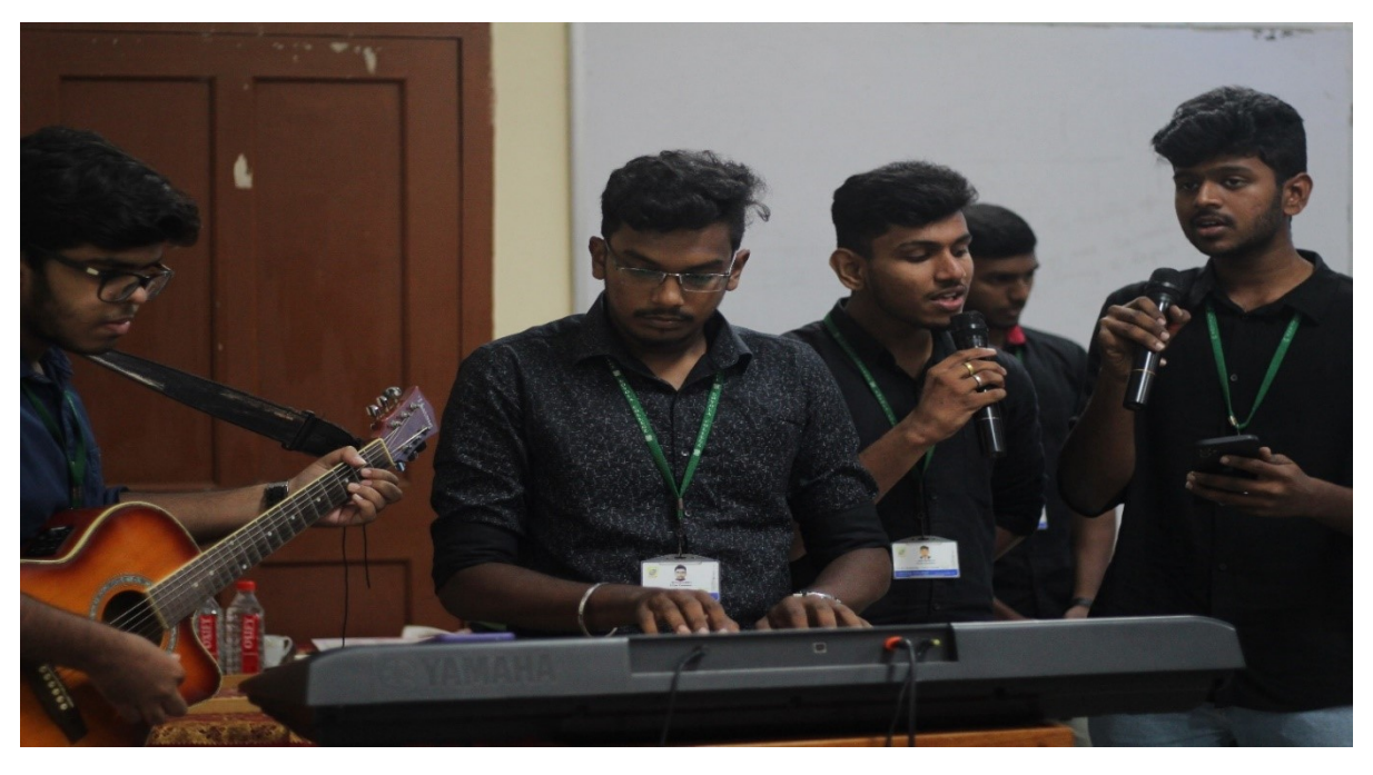
Invocation Song by Department Choir