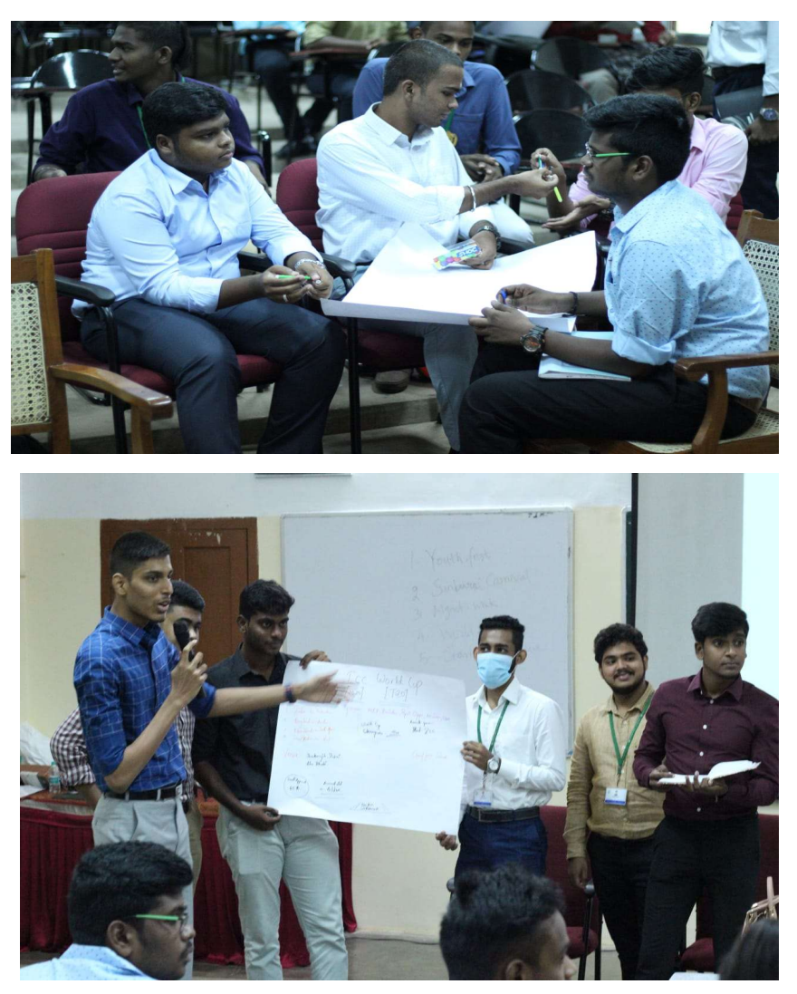
TEAM-A PRESENTING THEIR EVENT PLAN

At the end, 5 teams were formed and small group activity was conducted. Participants were given a timeframe of 25 minutes to plan out an event not necessarily related to college or forum activities. Specifics like event objectives, location, dates, financing, schedule etc., were required to be filled out and written on a piece of chart paper which was provided by the Chief Guest. Later, the teams were asked to present and speak about their plan and explain the details of the event planned out by them.