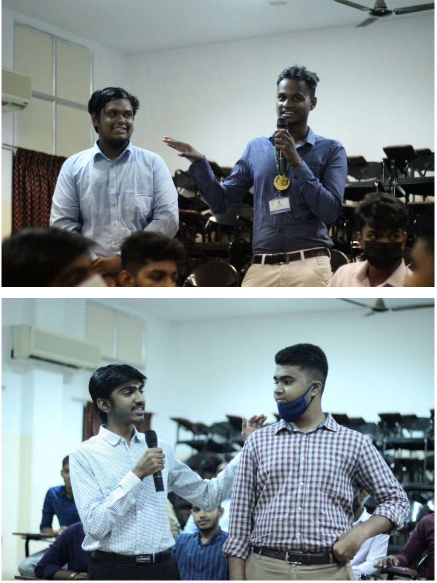
CREATING OPPORTUNITY FOR STUDENTS TO KNOW EACH OTHER

During the gear-up stage, the participants were expected to pick a random partner out of the crowd and give a brief introduction about him. This was undertaken as an ice-breaking session with a view to breaking through the barrier of communication.