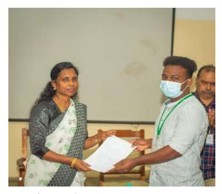
Distribution of questionnaires to enumerators