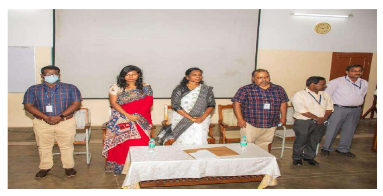
Training Inauguration - Invocation