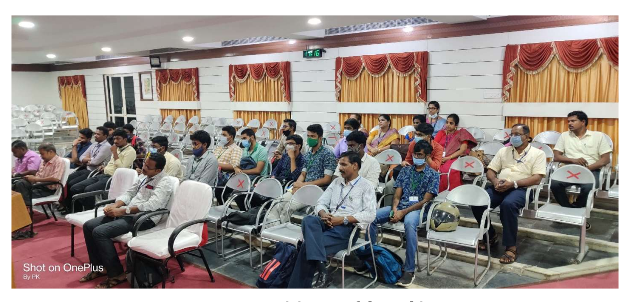
In-person participants of the webinar