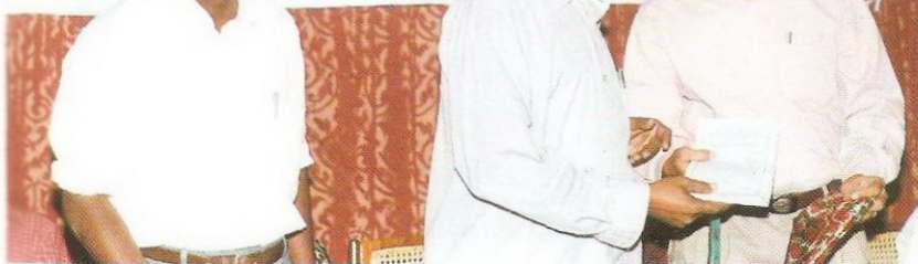
Enviro club ANTI-TYRE BURNING CAMPAIGN