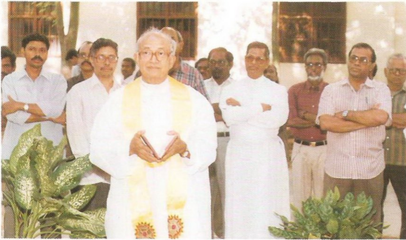
Blessing of COMPUTER ACADEMY