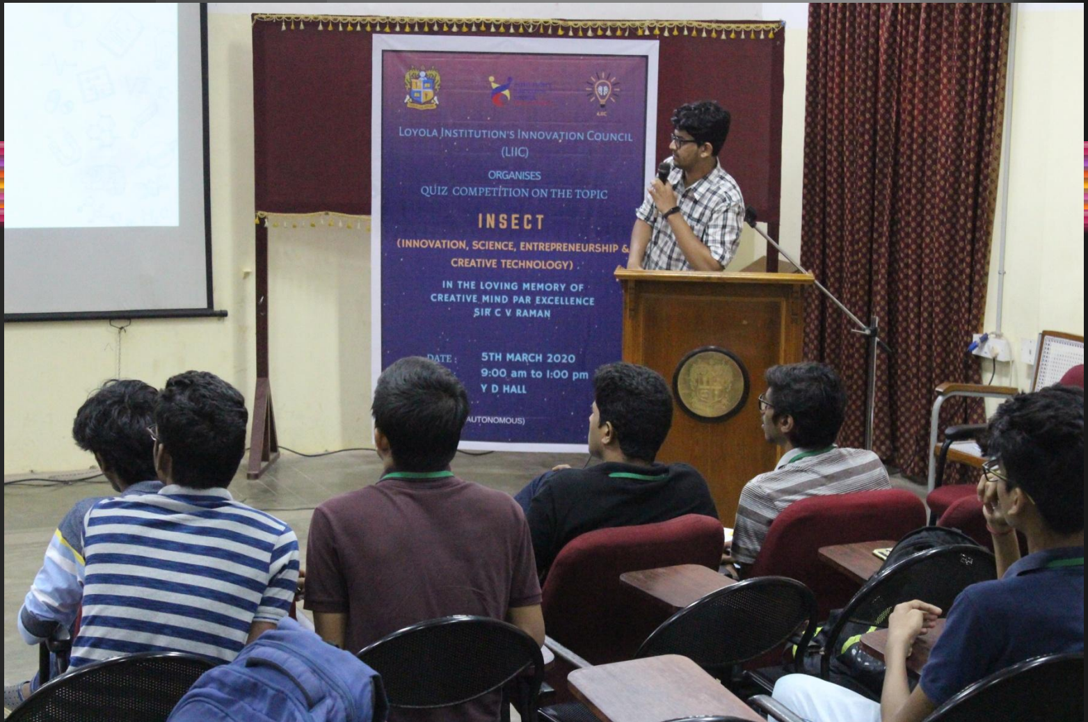
INSECT QUIZ 5 TH MARCH, 2020