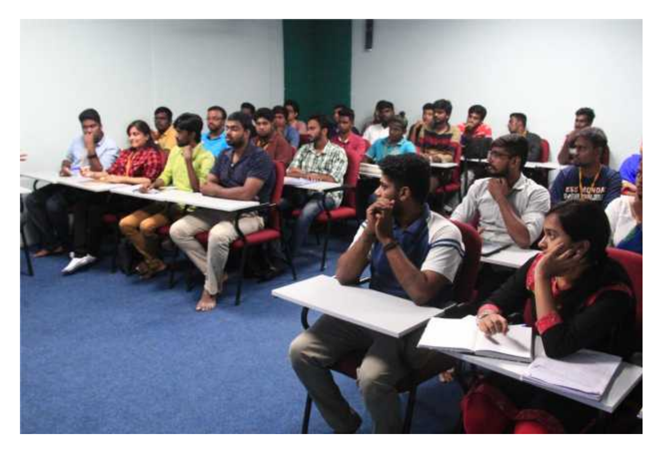
The HR students engrossed in the lecture.