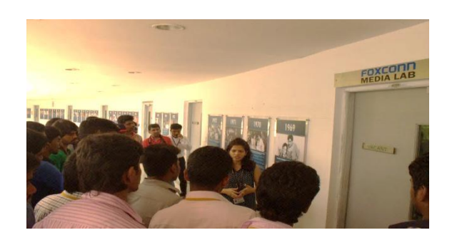
Highlights of the Visit

Students visited Whistling Woods International – a leading media school in India wherein a team from the organisation showed students the facilities and infrastructure of the institute. Students had a view of the shooting floors, sound mixing and dubbing theatres, and other various departments operating there.