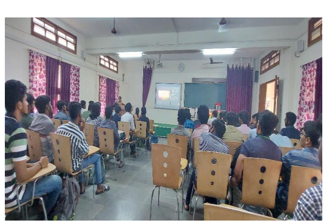
Participants of the programme