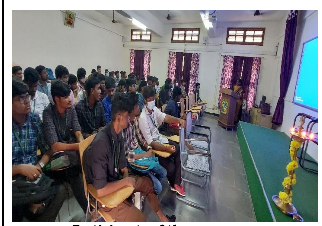
Participants of the programme