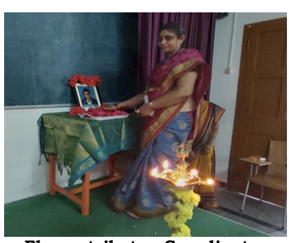
Flower tribute - Coordinator