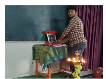
Flower tribute - Students