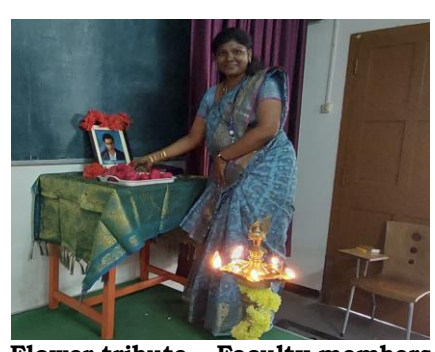
Flower tribute - Faculty members