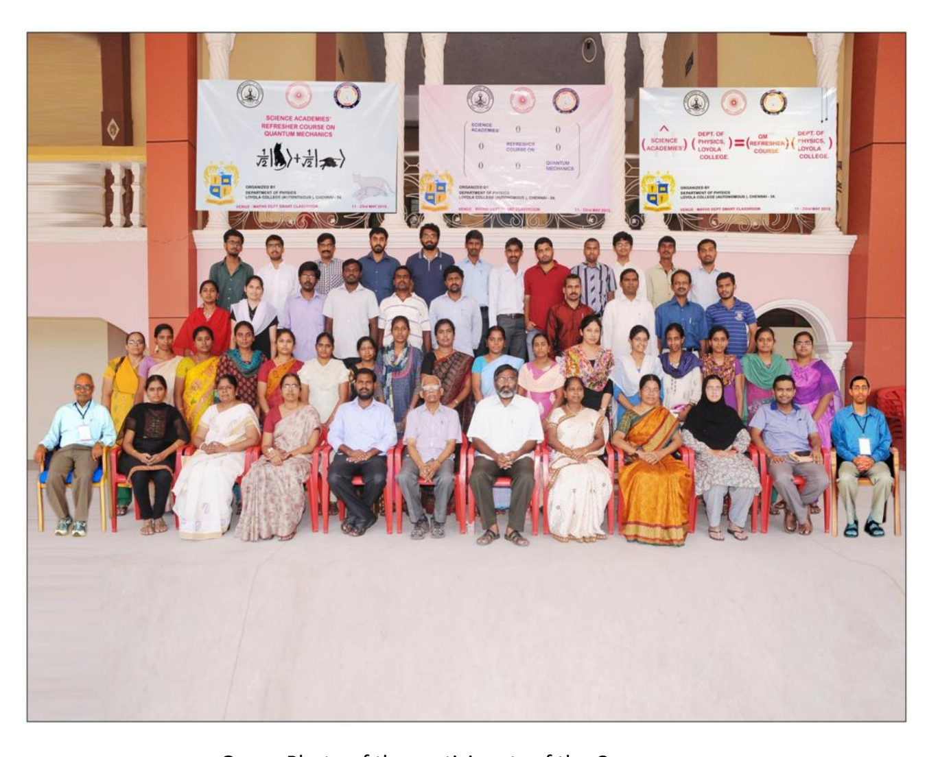
Group Photo of the participants of the Course