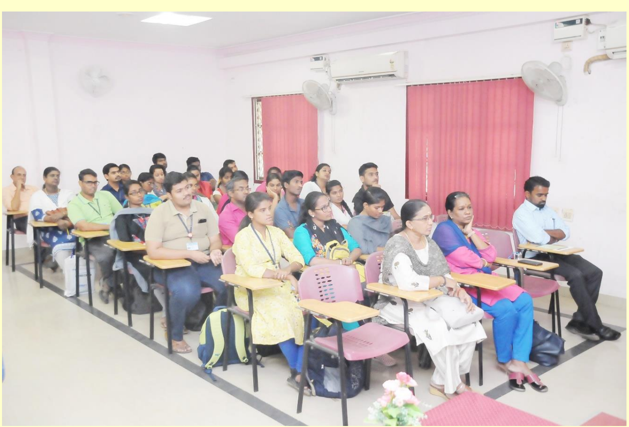
Section of the audience