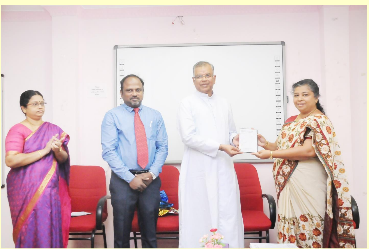
Release of CD