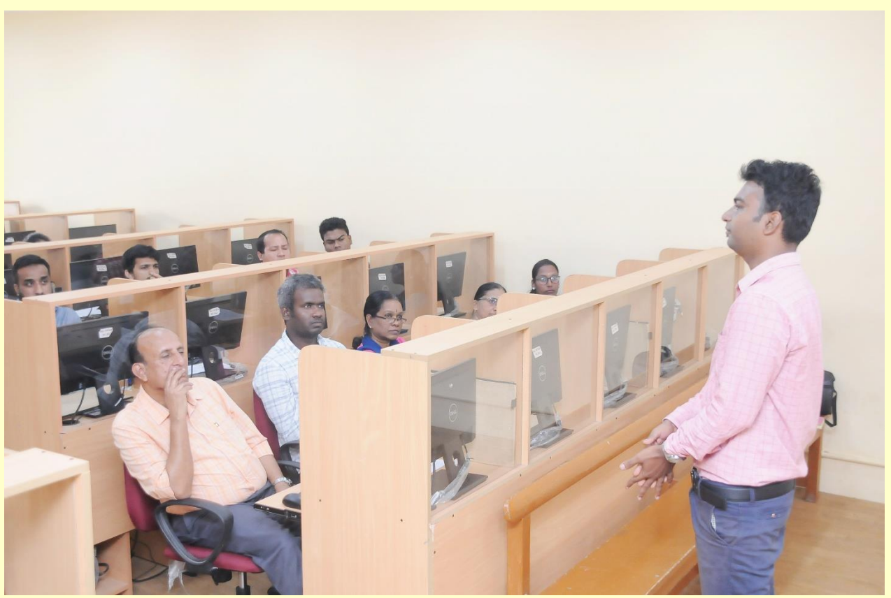
Technical session in progress