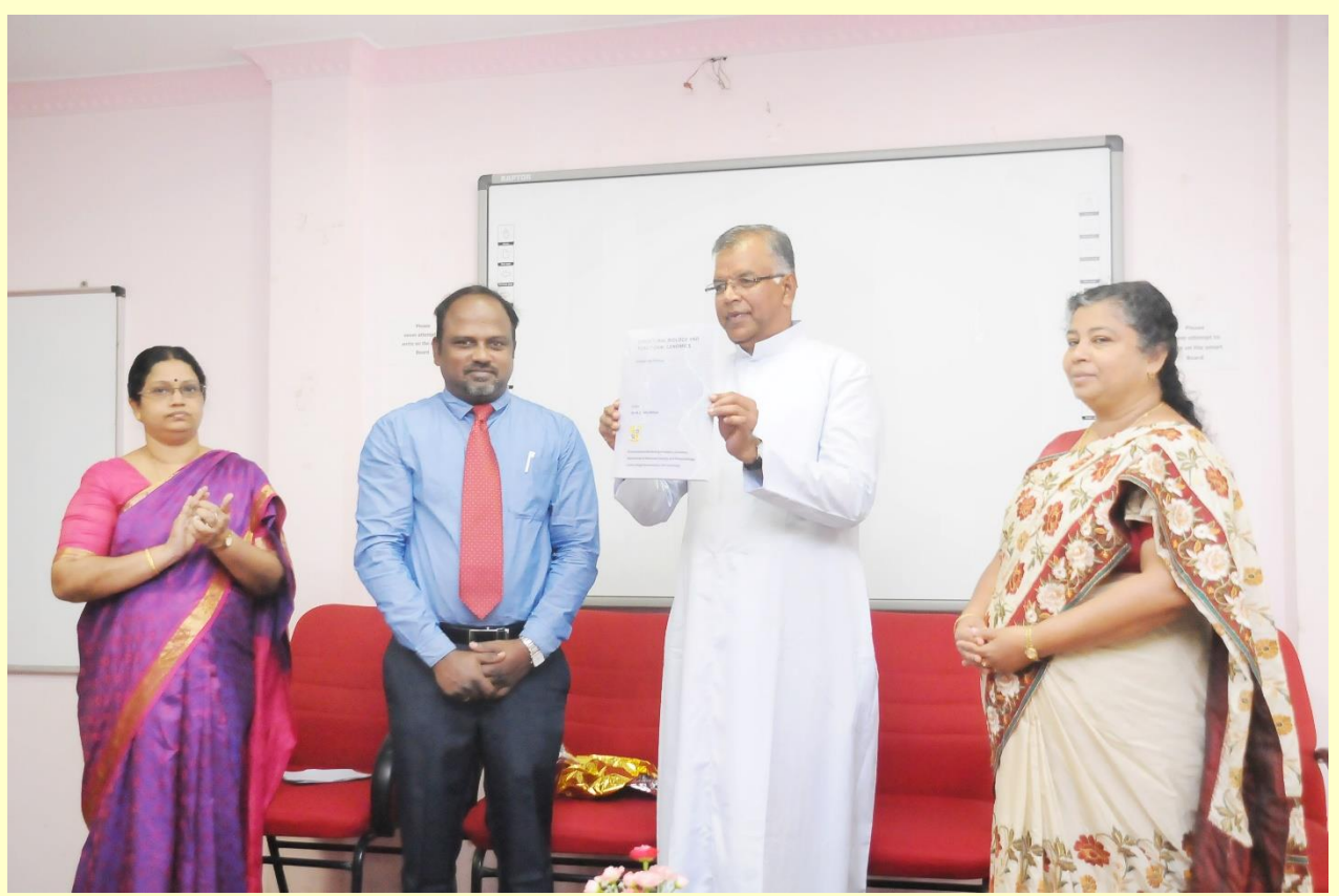
Release of the Training Manual