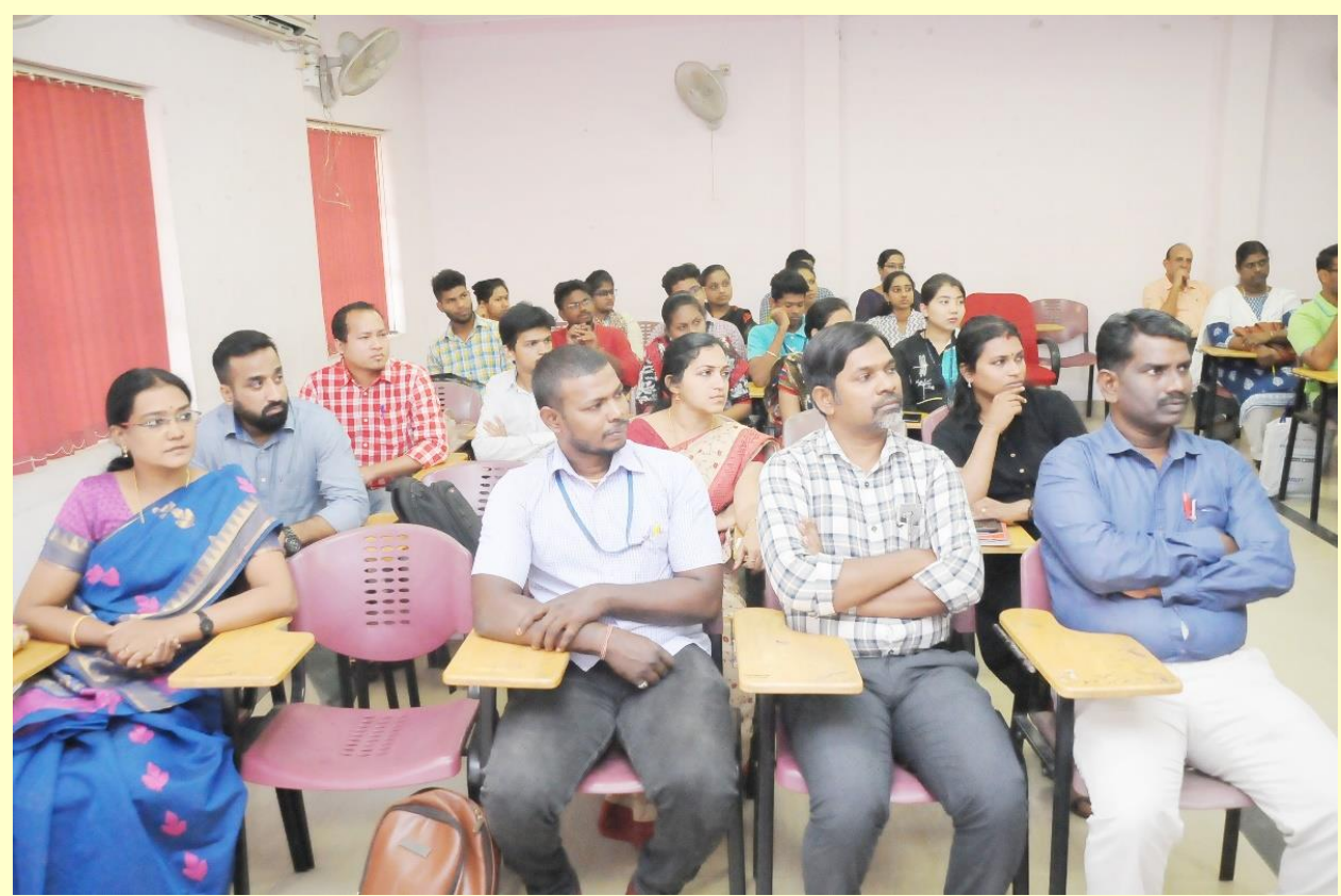
Section of the audience