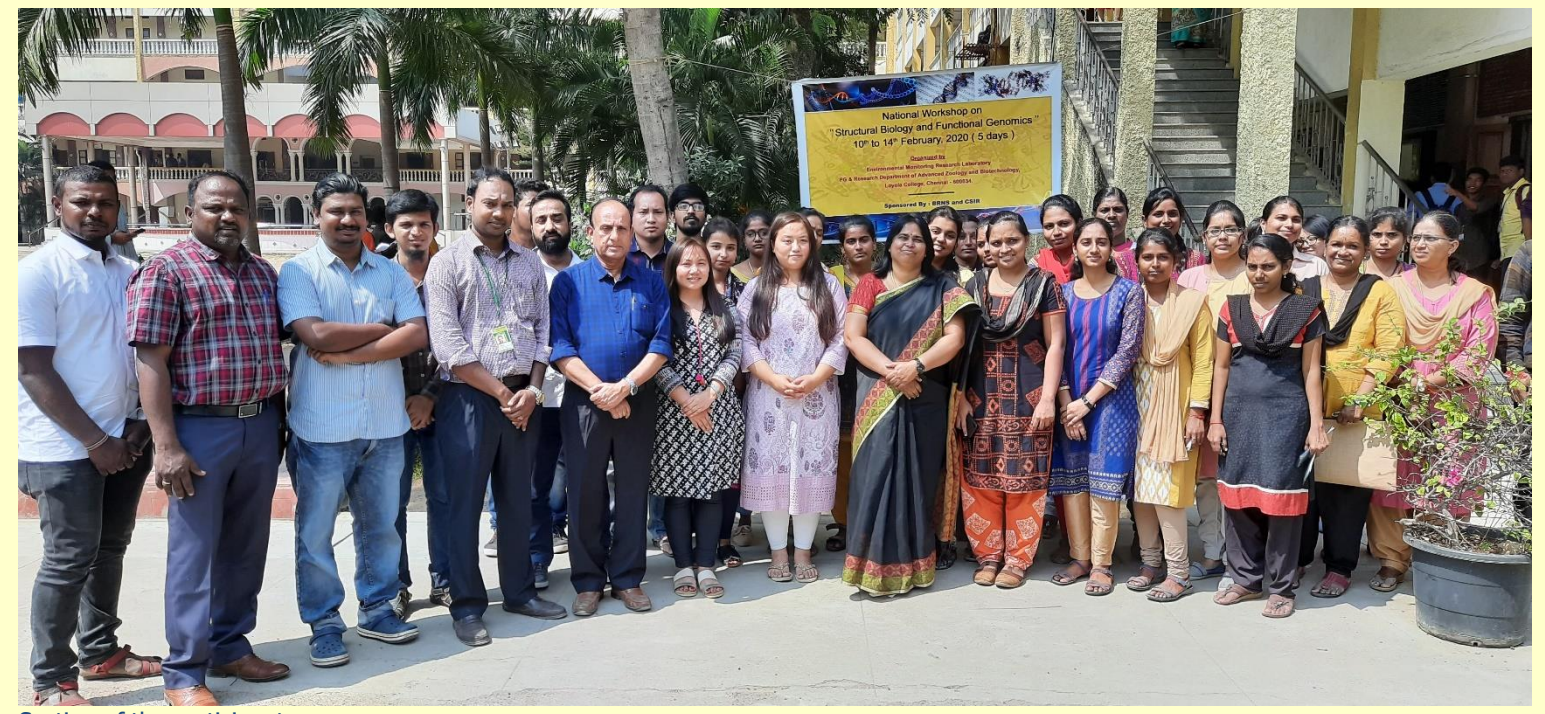
Section of the participants