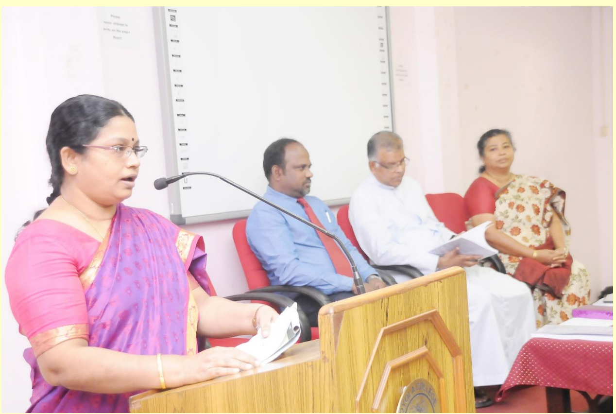
Vote of thanks by Organizing Secretary