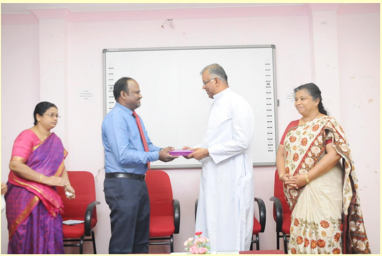
Souvenir to the Chief Guest